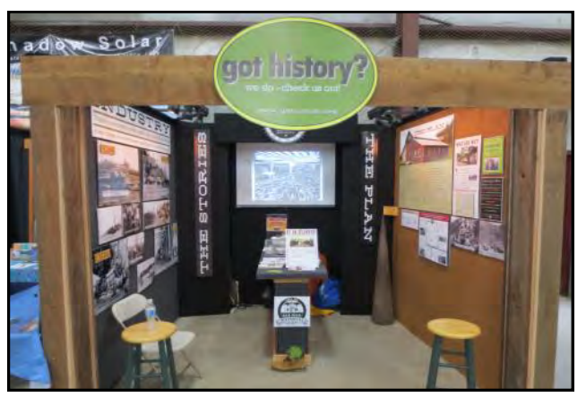
Our information booth at the County Fair outlines the project. The booth is now in the entrance atrium.

*Partial funding of the barn expansion project was made possible by grants from the Heritage Capital Project Fund administered by the Washington State Historical Society.