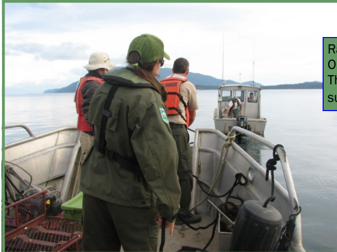
Rangers from Sucia towed us into the “ditch” on Orcas Island. A fun way to end our final work party. Thanks to the WA State Park Rangers for taking such good care of us.